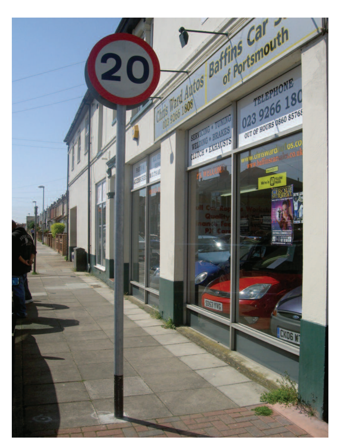
Figure 3.4 20 mph limits have been introduced in most residential streets in Portsmouth