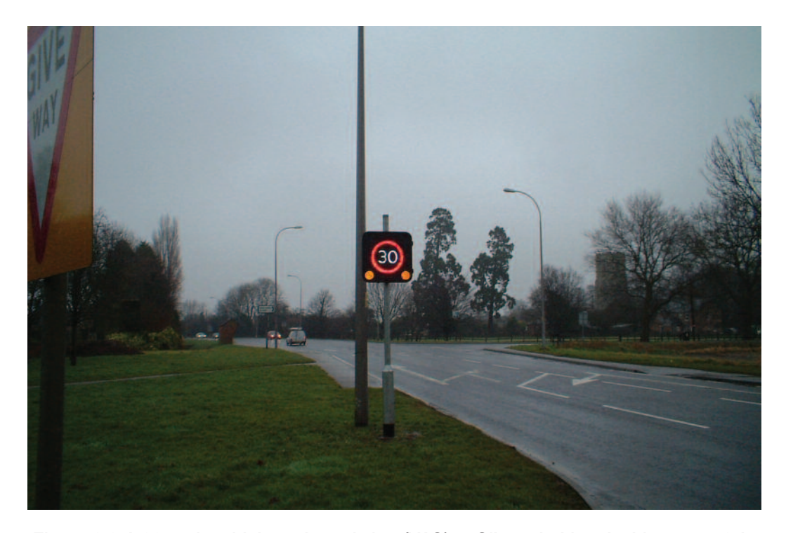
Figure 3.2 A 30 mph vehicle activated sign (VAS) at Sibsey in Lincolnshire, one of the rural demonstration projects