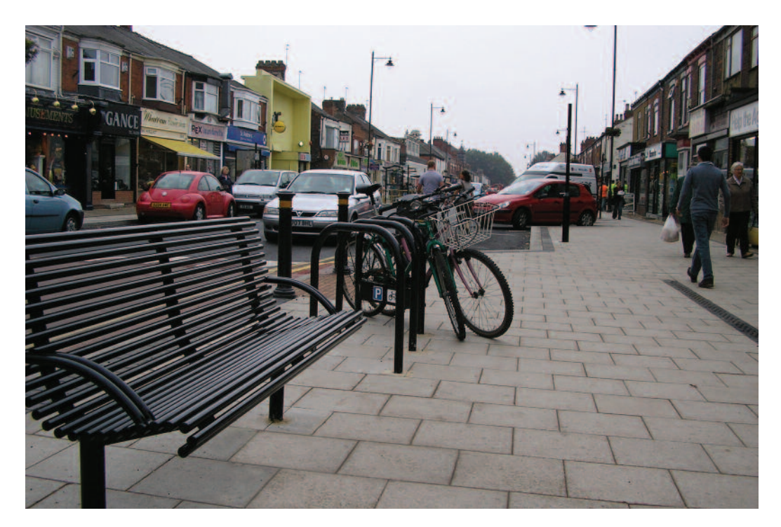
Figure 3.1 Ten demonstration mixed priority routes, such as this one in Hull, have improved safety, the environment and regenerated busy shopping streets (photo: Hull CC)