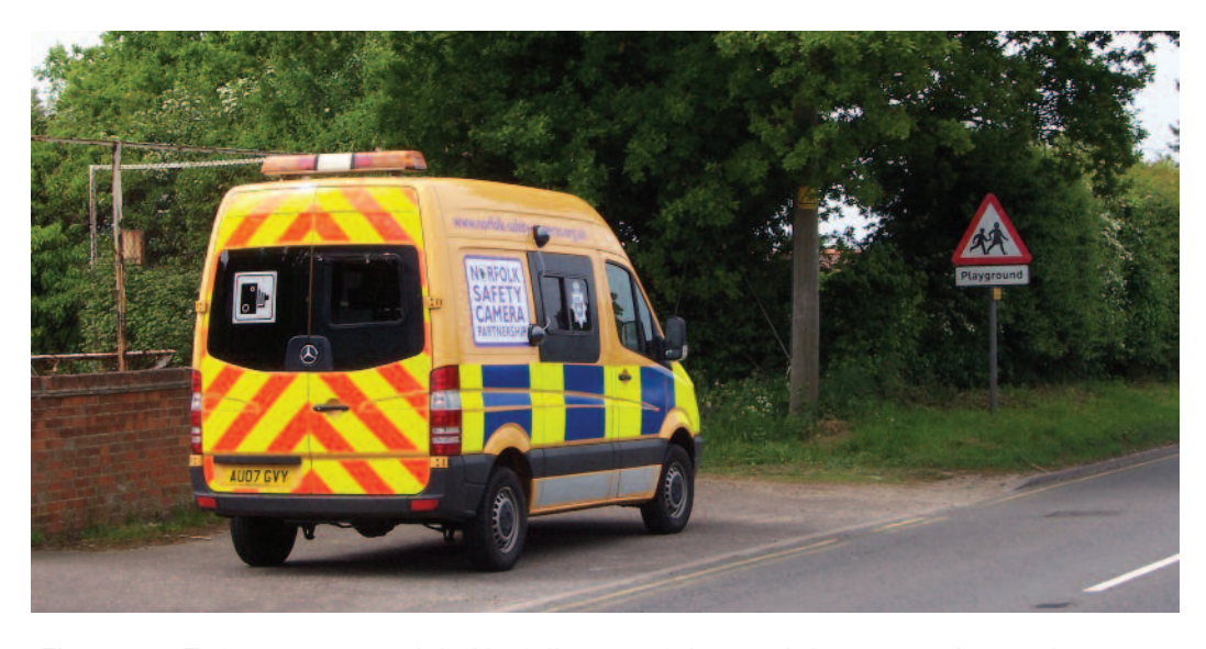
Figure 3.3 Enforcement work in Norfolk, one of the rural demonstration project areas